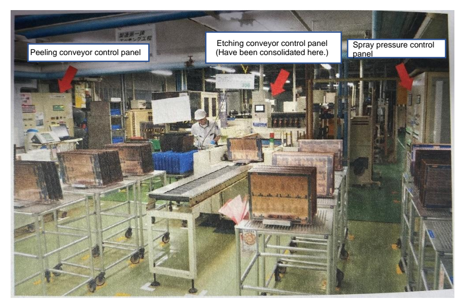
Figure: In the past, the etching process line had control panels in three different locations.